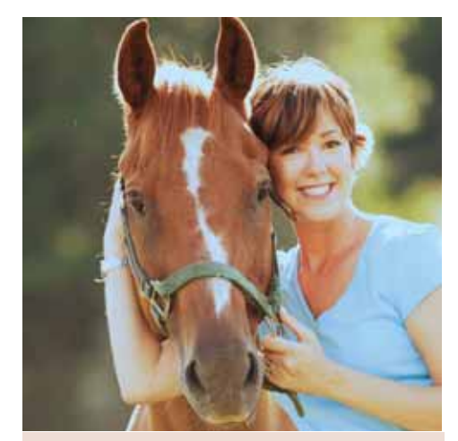
Your horse changes with the seasons — stay current on seasonal issues and health alerts with Health Flash .