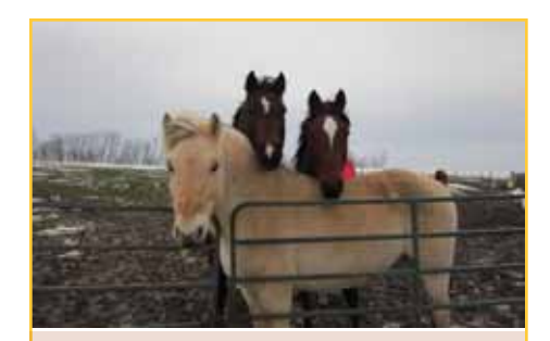
2012 EquiMania! Photo contest winner: Ava Sytsma