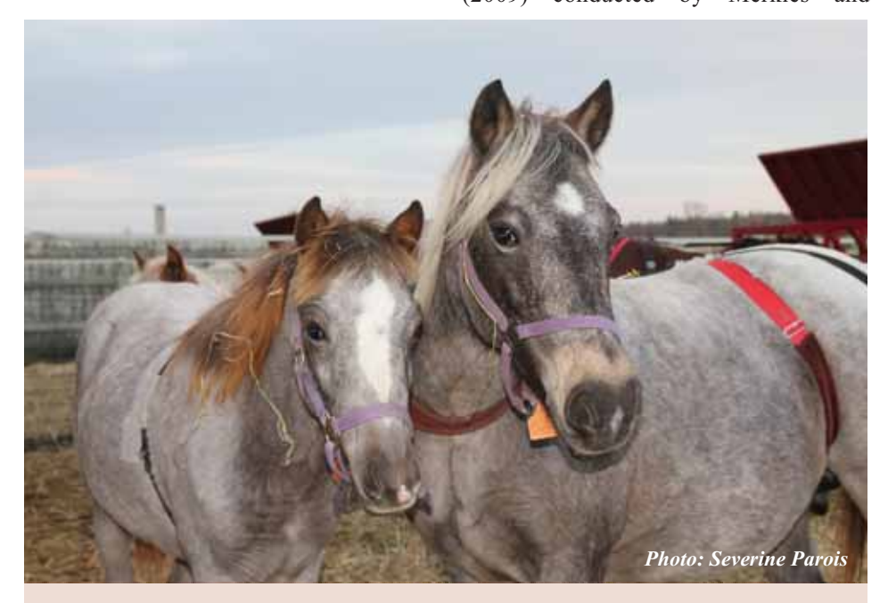
Two-stage weaning may improve welfare in horses by reducing stress.